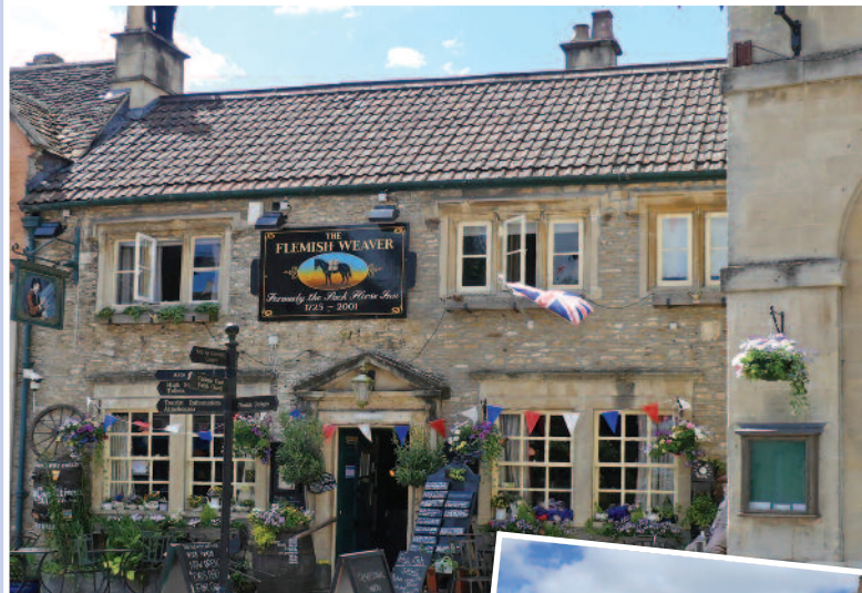
The Flemish Weaver, Corsham