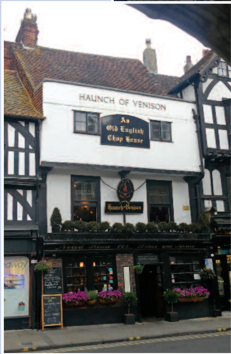
Eccentric and delightful in equal parts, the Haunch of Venison was built in 1320 as a church house for the adjacent St Thomas's church.