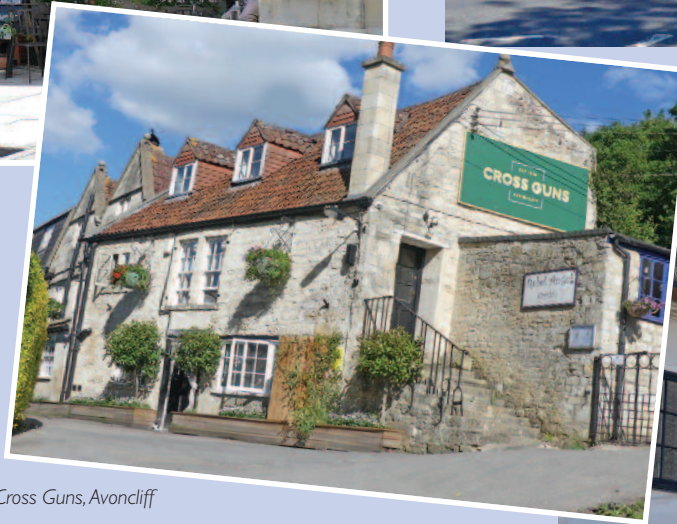
Cross Guns, Avoncliff