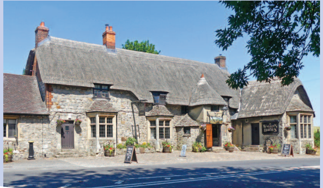
Above: The Waggon & Horses, Beckhampton